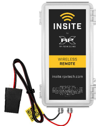
Self-Starting, 1-minute, 180-day Insite Concrete Logger connected to Wireless Remote

InSite loggers are wired to increase reliability and to reduce the per-test cost to your project