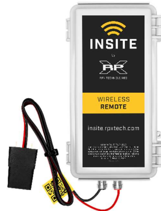
Self-Starting, 1-minute, 180-day Insite Concrete Logger connected to Wireless Remote

InSite loggers are wired to increase reliability and to reduce the per-test cost to your project