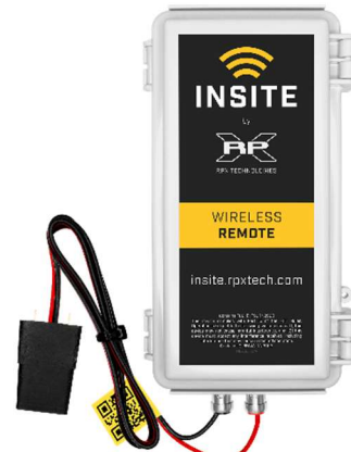
Self-Starting, 1-minute, 180-day Insite Concrete Logger connected to Wireless Remote

InSite loggers are wired to increase reliability and to reduce the per-test cost to your project