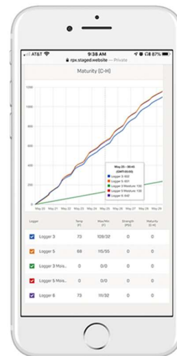
InSite Cloud Software on Wireless Device

InSite puts you in control and helps you deliver faster, safer concrete!