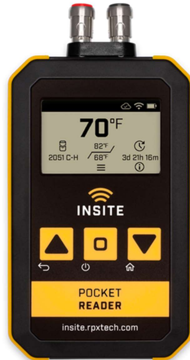
InSite Cloud Software on Wireless Device

The Pocket Reader can start loggers and can be used to spot-check the logger's current status. It can be used to view the loggers battery voltage, runtime, and firmware version. In short it can be used as your primary method of accessing, uploading and monitoring concrete data. A Pocket Reader and Loggers are all you need to start monitoring temperatures and determining concrete strengths!