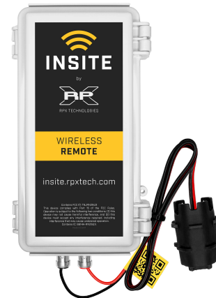
Self-Starting, 1-minute, 180-day Insite Concrete Logger connected to Wireless Remote

InSite loggers are wired to increase reliability and to reduce the per-test cost to your project